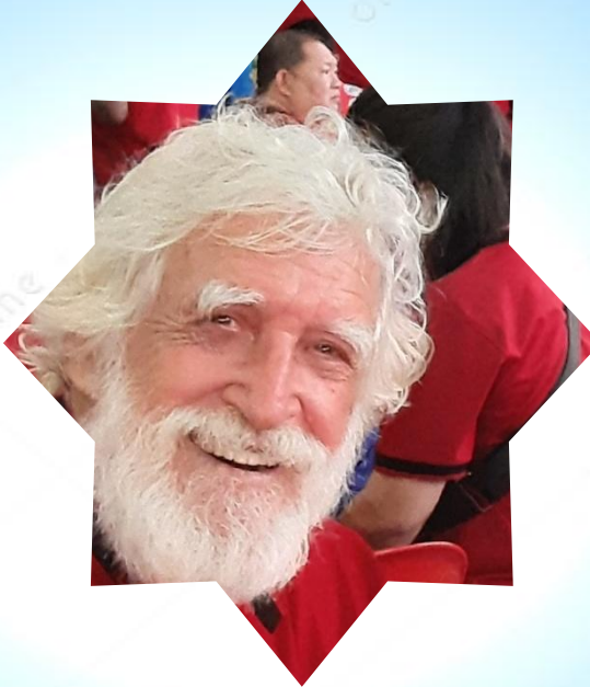
Kissing (h)er 4th