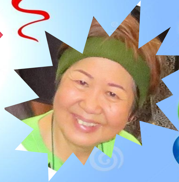
Mem Sahib 7th