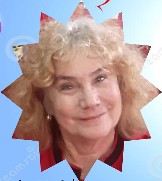
Kiss Me 3 rd