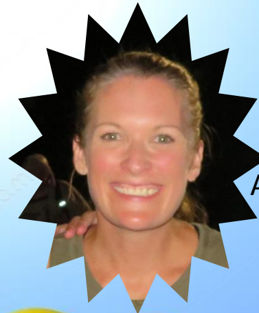
Arse over Tit 29 th