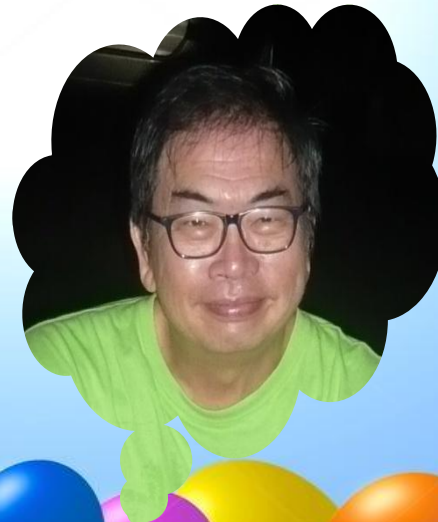
Marks & Spencer 26th