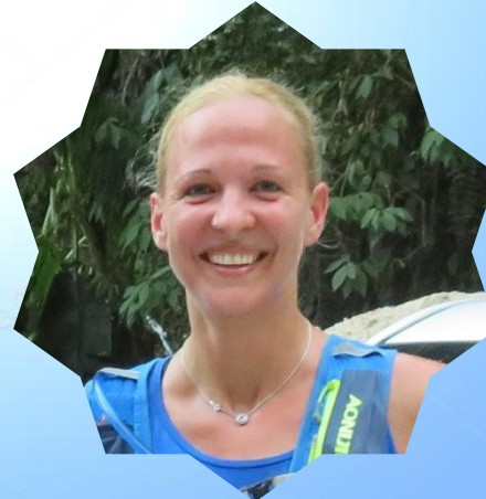
Gyrating Gypsy 31st