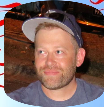
Wheels 13 th