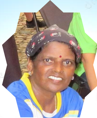
Speed Hound 7 th