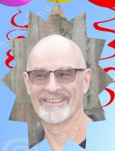
Iceman 3 rd