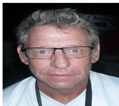
13, Mini Sausage