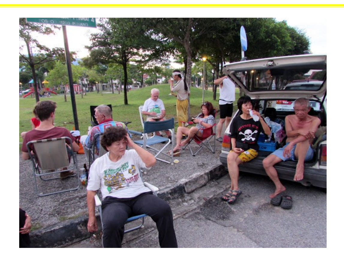
You no happy, f*** off