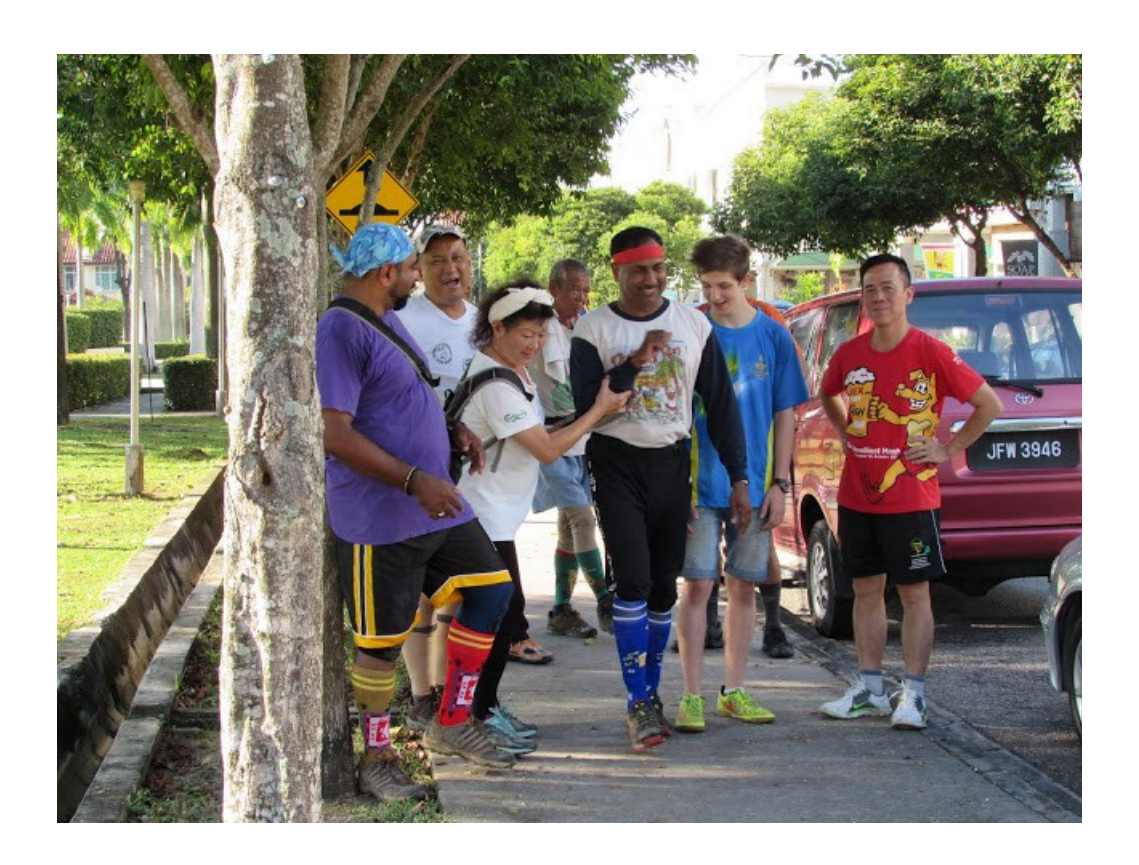
Beauty Queen gives Goodyear a hand

Next week it is Rupiah's run at TAR College New Road. Please come and support.