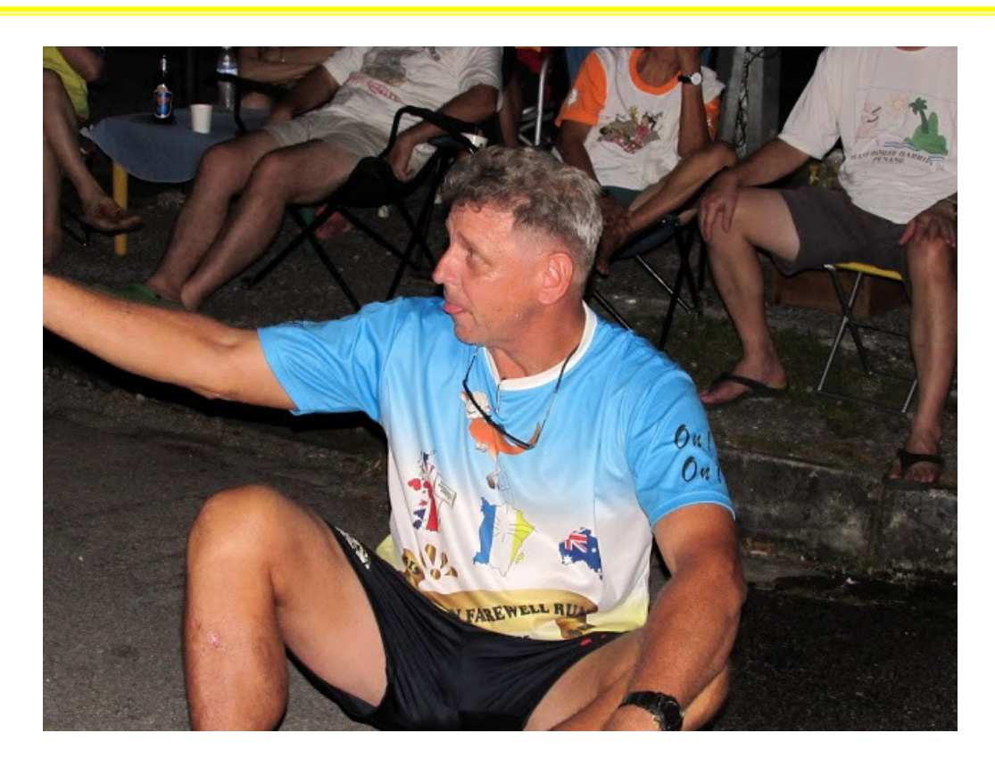
VicePresident of the Dinner Club