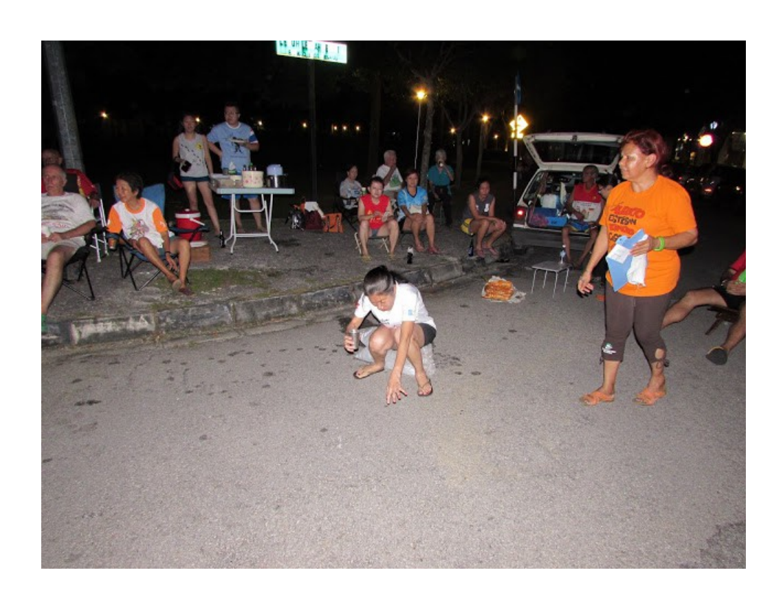
Wobbly Hot Lips