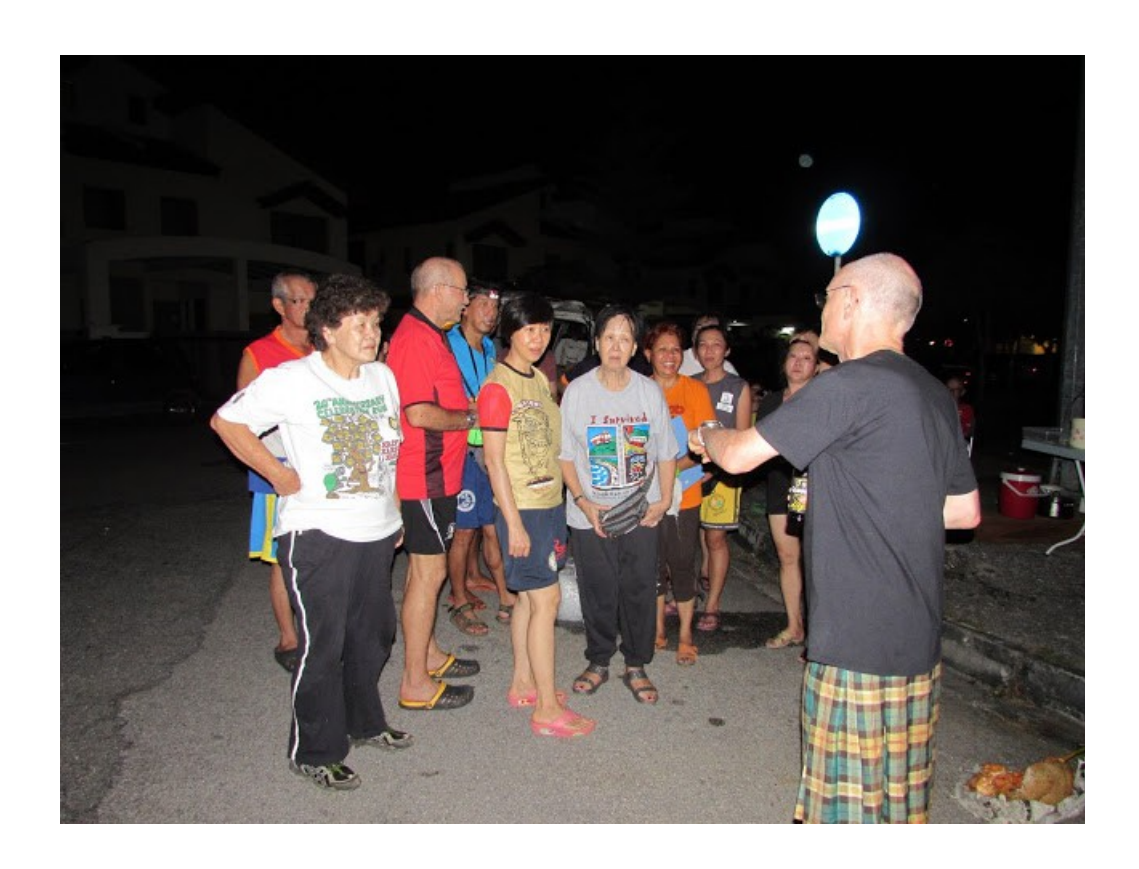
I'll lift my kilt if you . . .