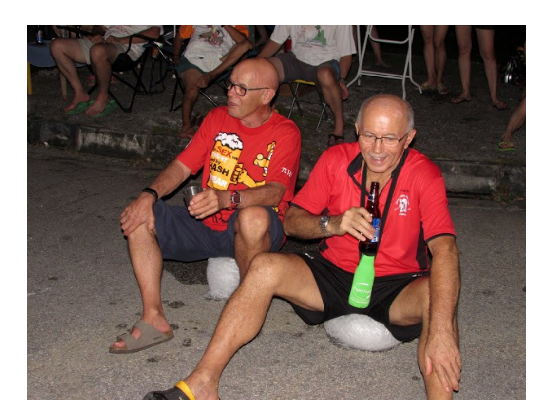
The terrible twins on ice for skiing iwithout snow