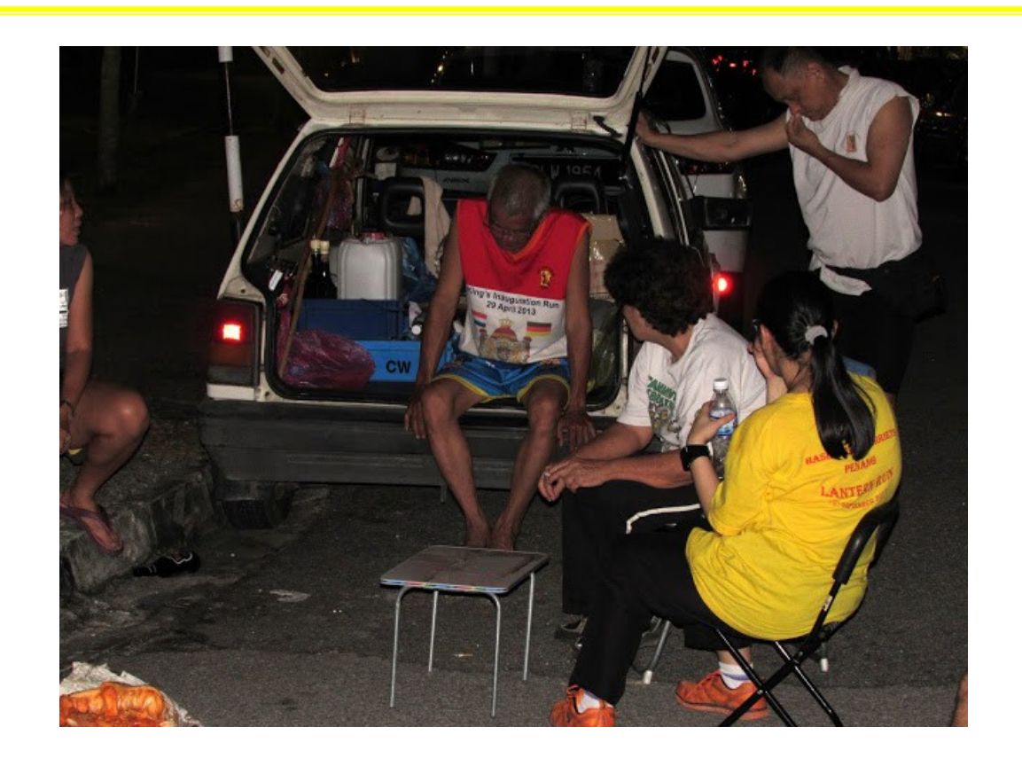
You still no happy, why you no f*** off