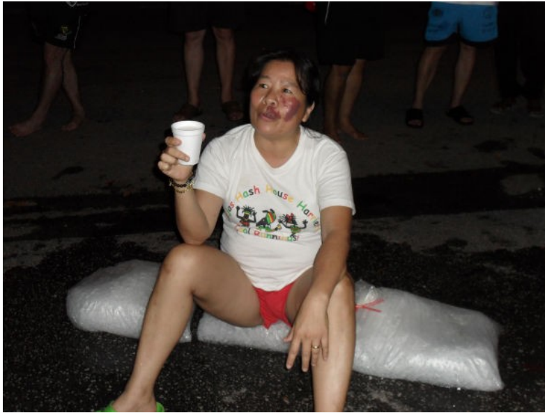
Then she welcomed back the On Sex.