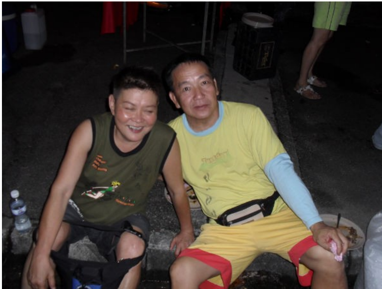
Twins? Maybe not!