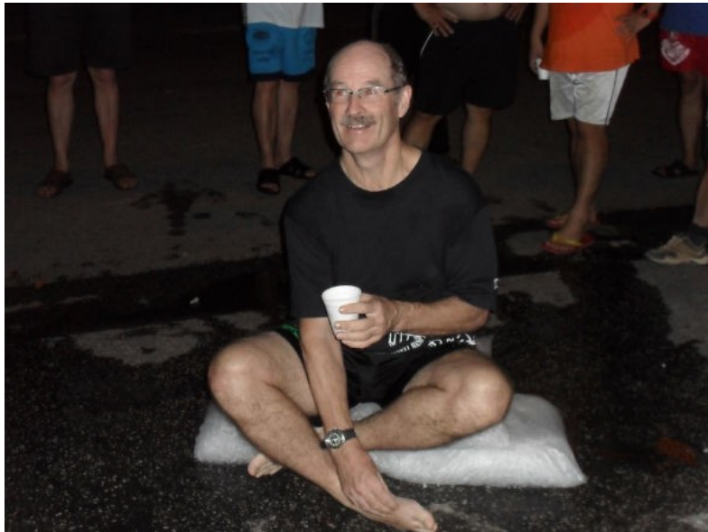
Iceman is congratulated for being the only one to follow the correct trail!