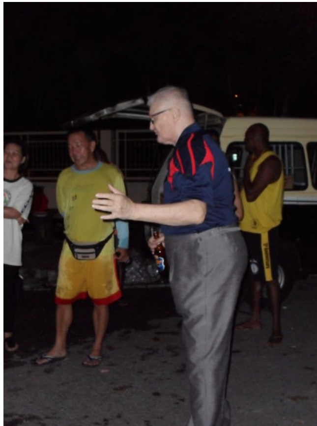
Finally Monty Python arrived, just in time to serenade the Hare...