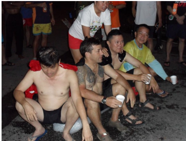
Who welcomed the guests!