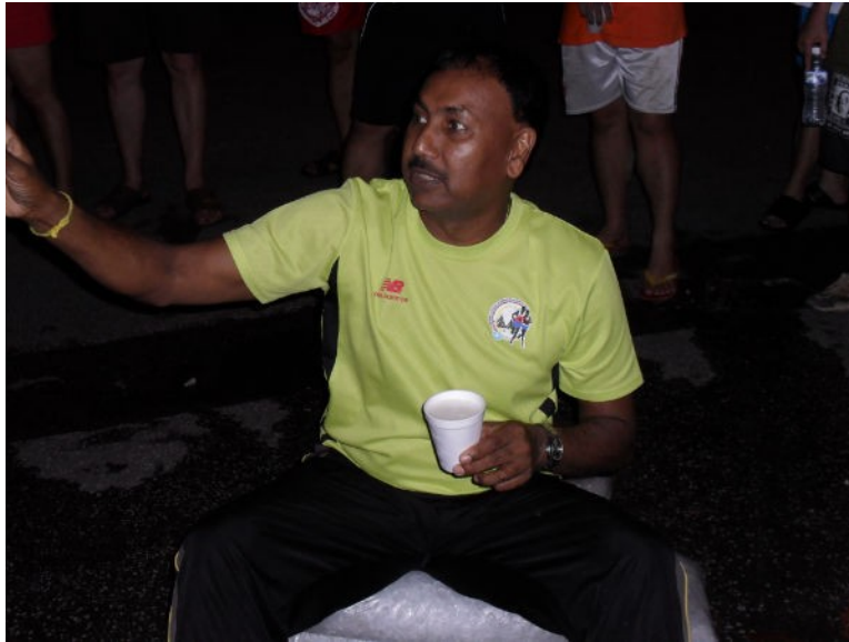
Take Care charged Goodyear for leading the rest of the pack to "Ho Lan!"