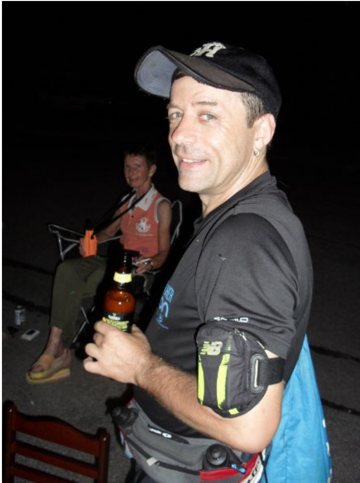
Our guest from Japan, Hole in None