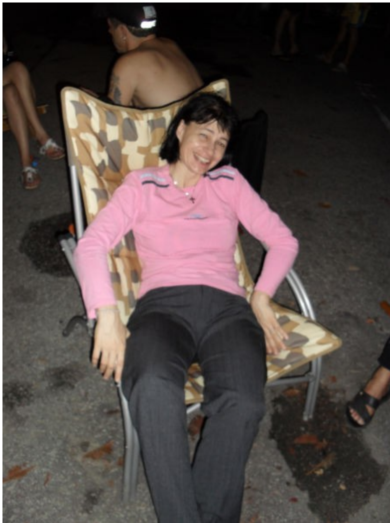
Take it easy!