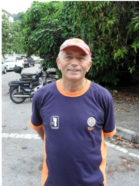
The Hare: Money Manfred