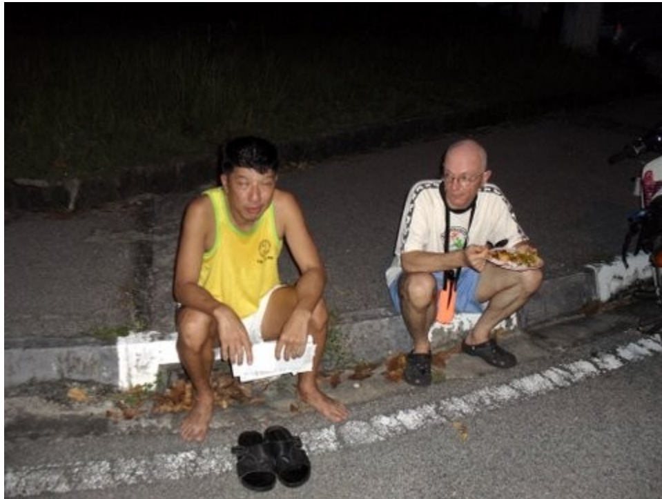
Gee Man recovering whilst The General looks on!