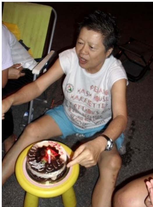
HAPPY BIRTHDAY RAMBO!