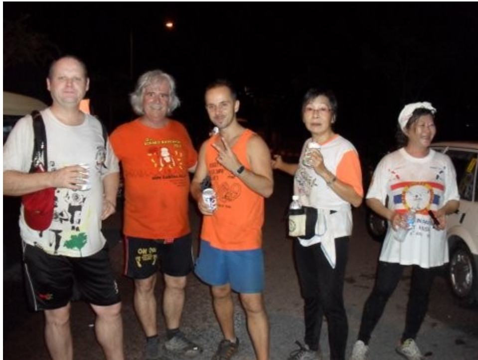
Some of the rescued and the rescuers!