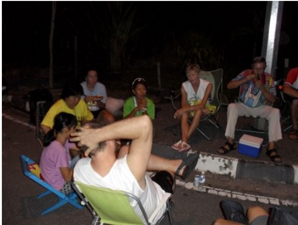
Terlalu malas untuk menjalankan