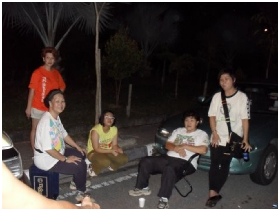
Our usual bevy of lovelies!