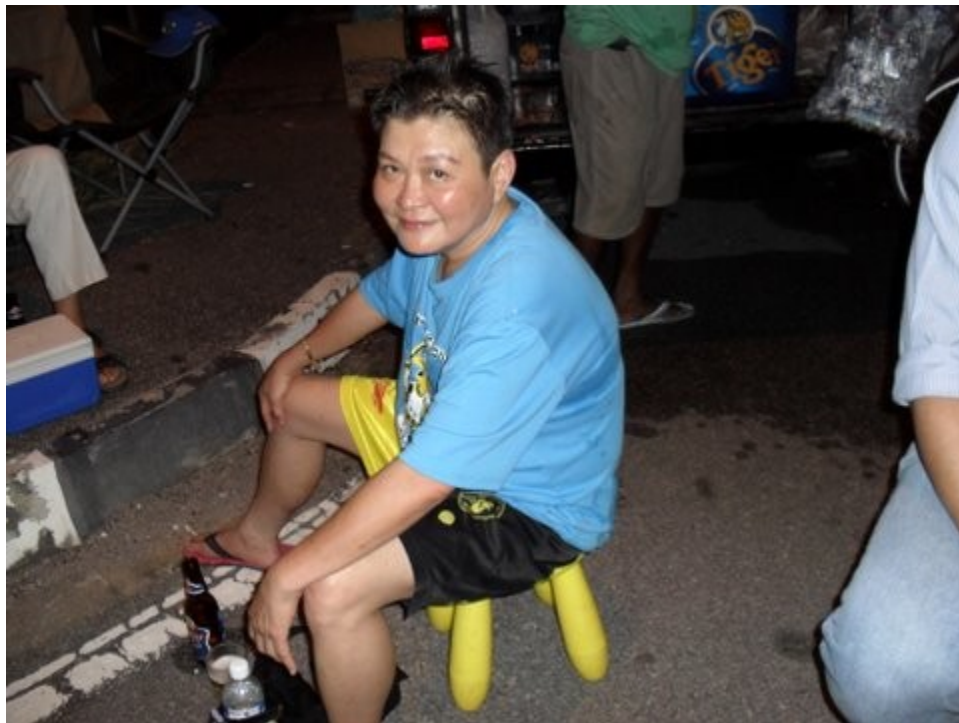
Uncle Bee on her milking stool!!