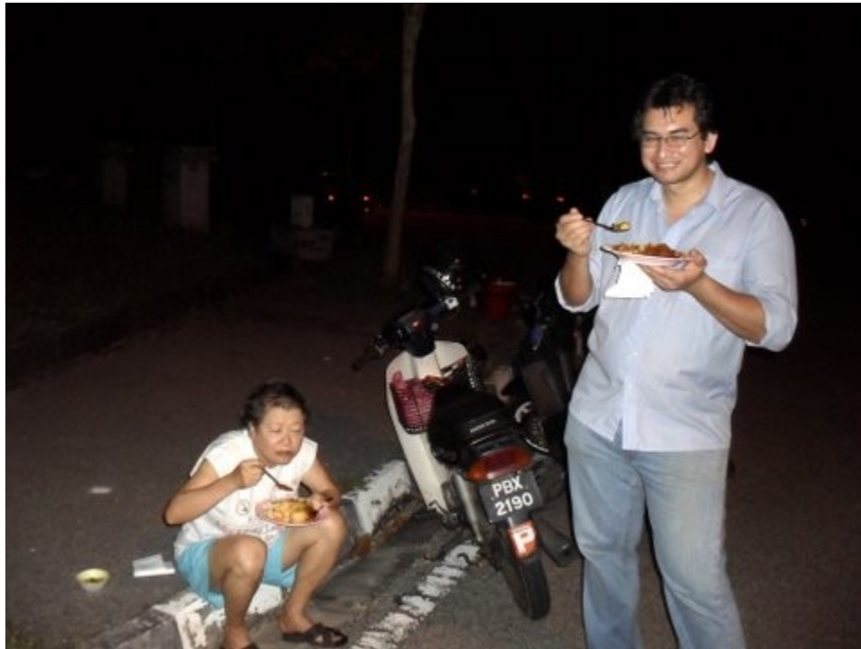
Rambo and Bai Pass seem to be enjoying the food.