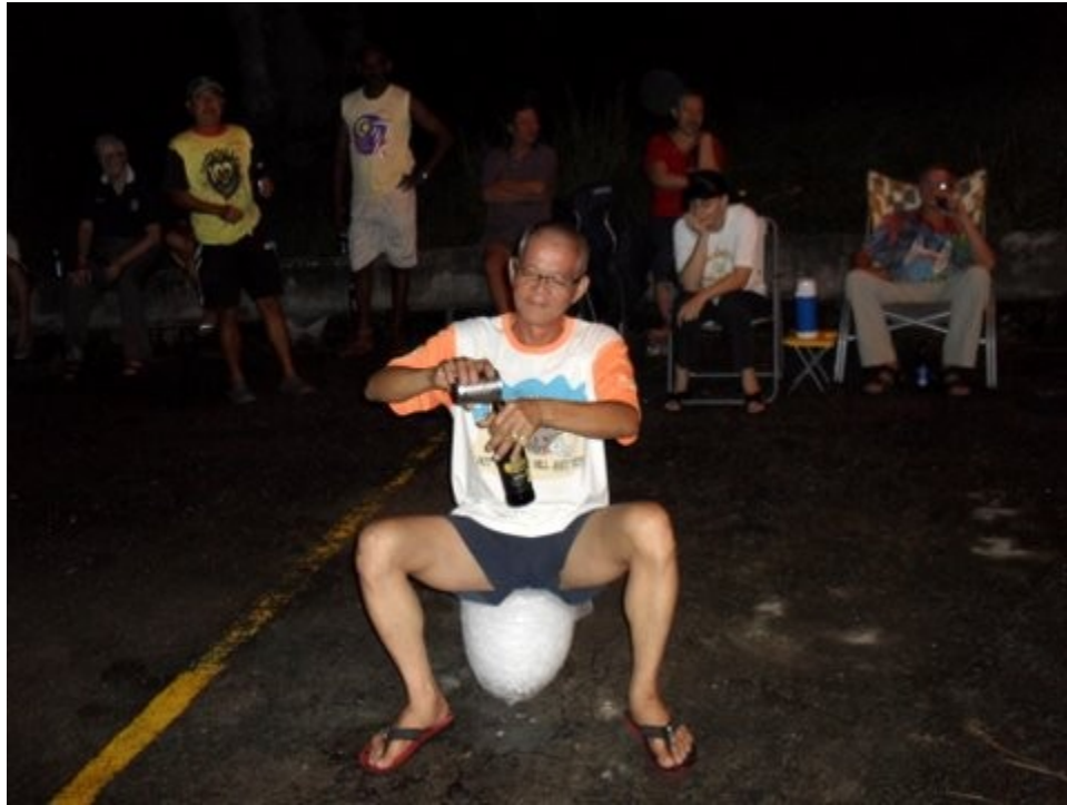
Take Care was thanked for being the perfect gentleman in escorting Peggy back safely to the run site