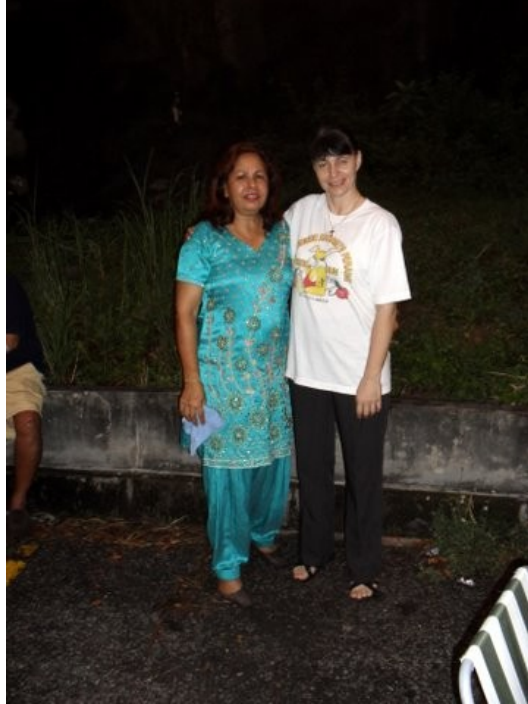
Not quite hash attire but very fetching Justbeer!