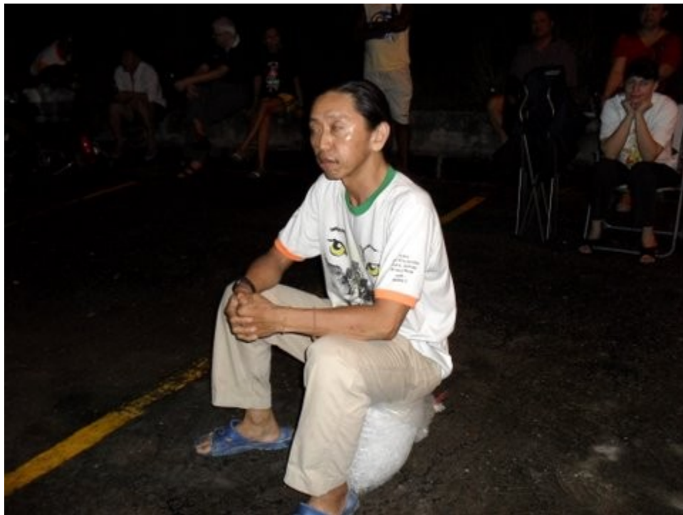
Longhair arrived late as always but this time didn't run!!!