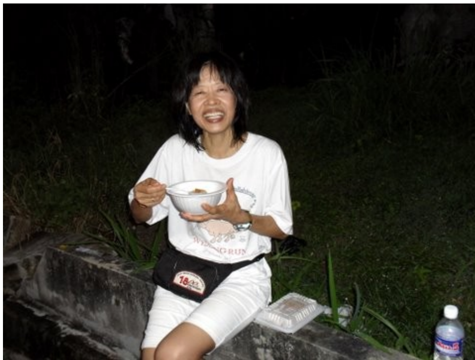
Pussycat is certainly enjoying the food!