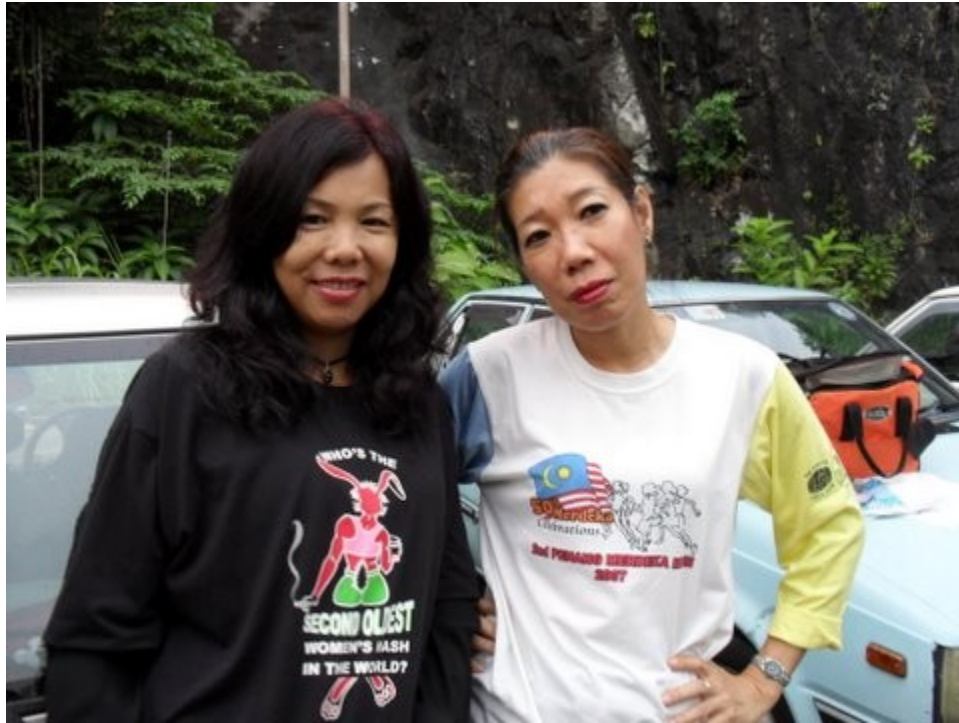
A couple of real beauts!!