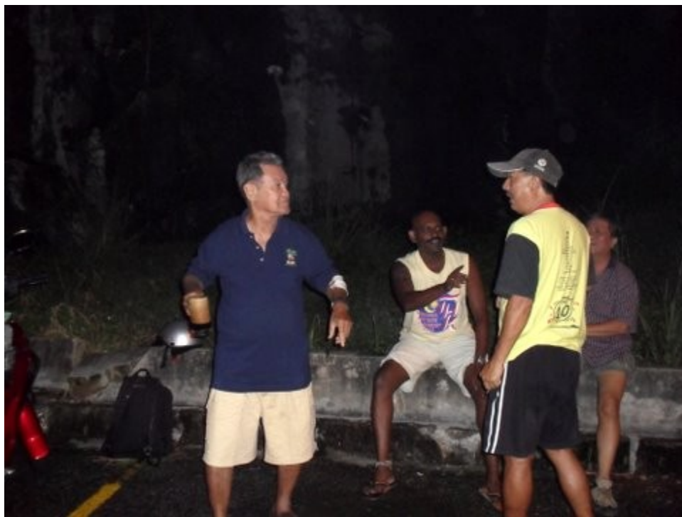
'Do you want to dance?'