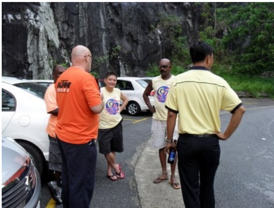
They're off on the run so we can enjoy a nice relaxing cold one!