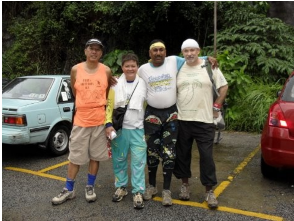
Bunny and Co-hares