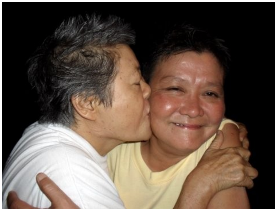
Seeing the Wild Boar was an emotional experience for our VGM! She was so happy to be back!!