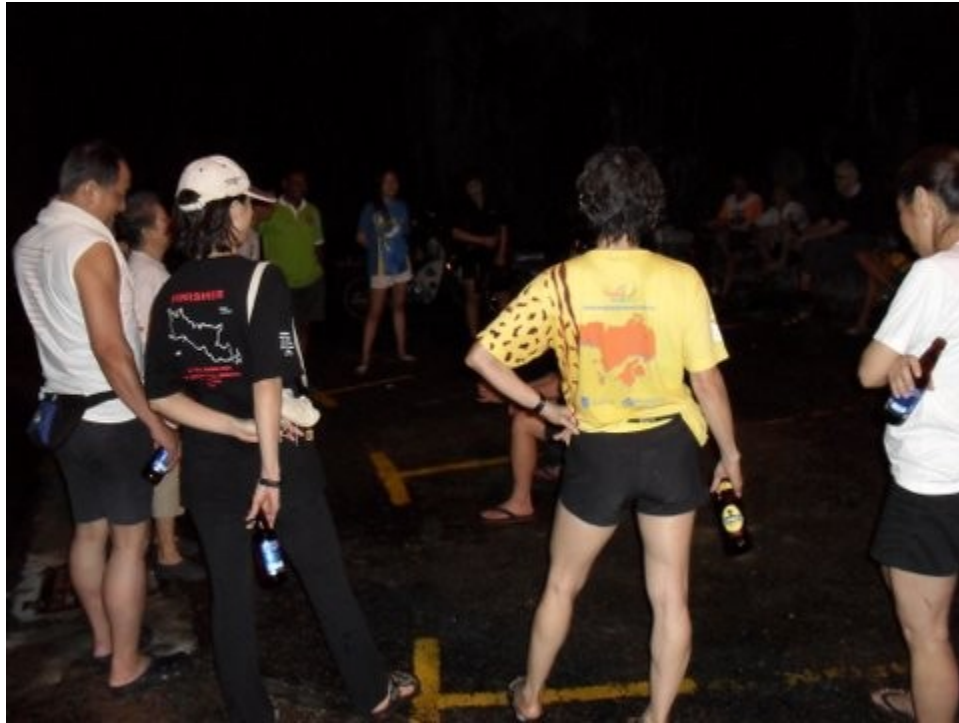
A 'behind' the scenes look!!