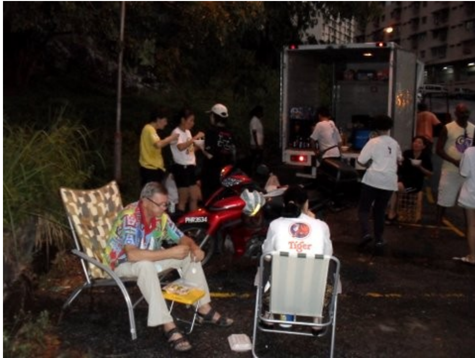
Time for makan!