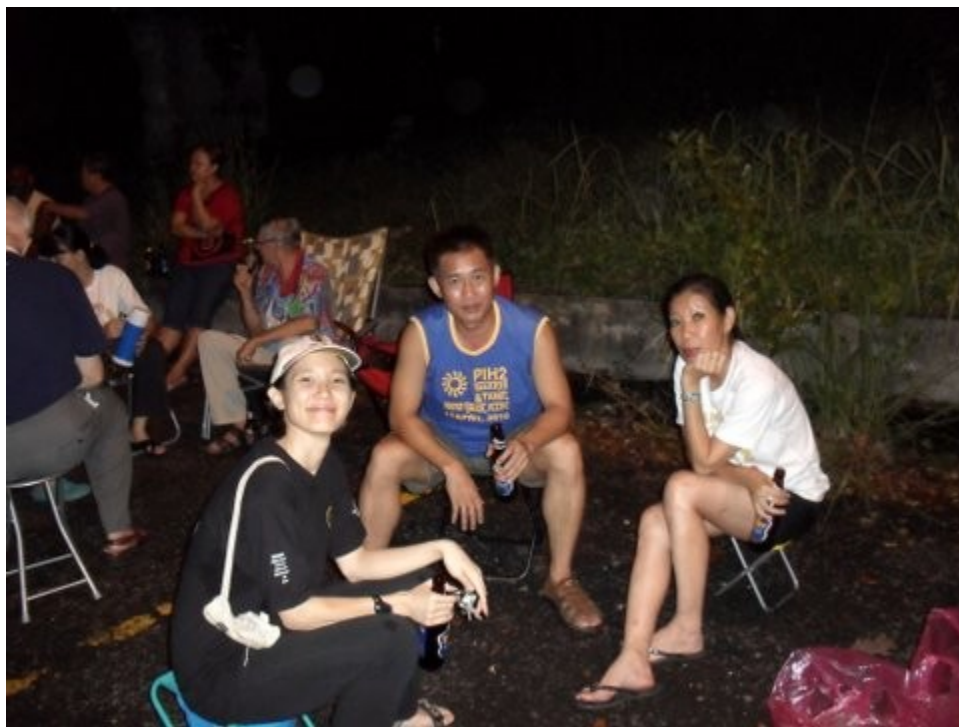
Clarice, Cumming Soon and Hot Lips make a good threesome!