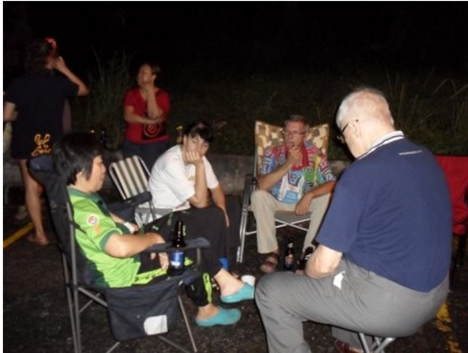
Is this thinkers corner??