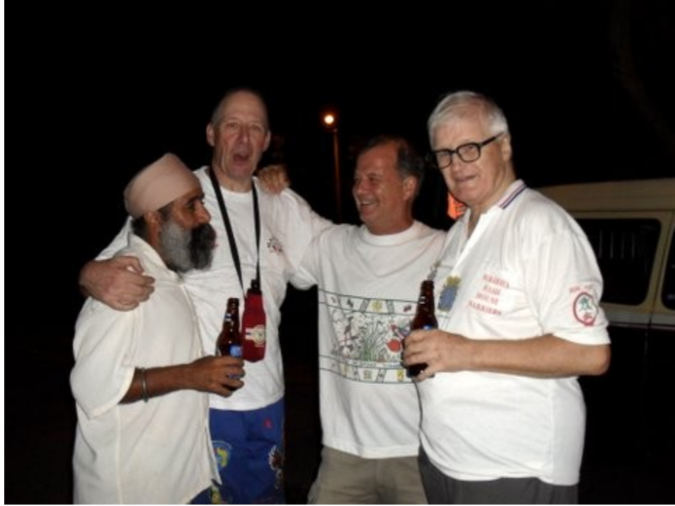
All friends together boys!