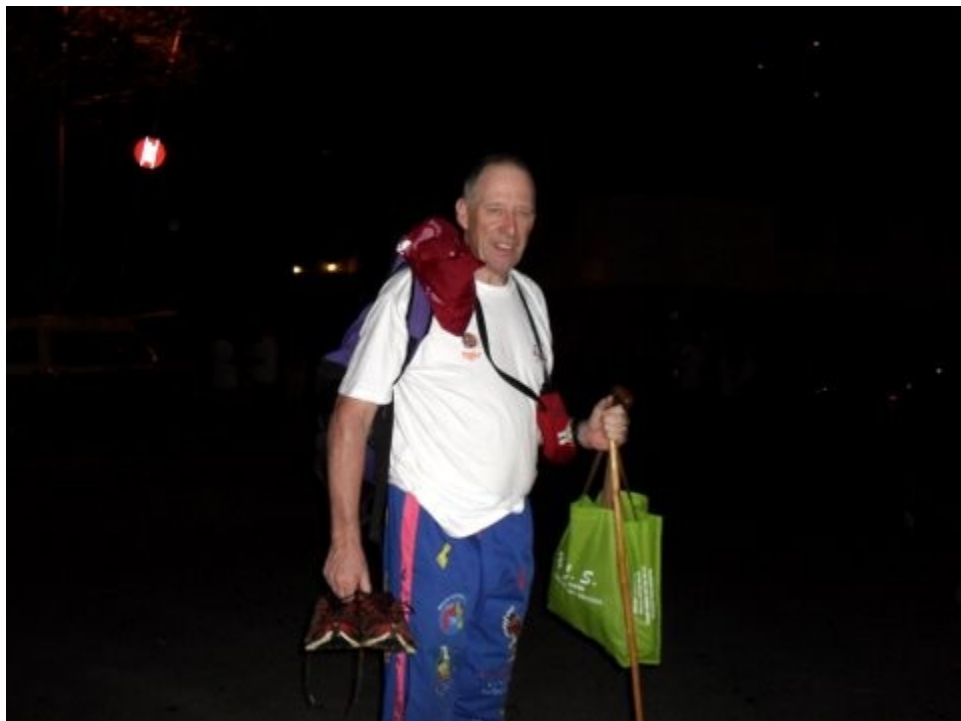
Big Willy turning into a bag man!!