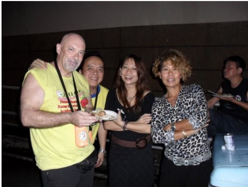
Beauties and the Beasts!!