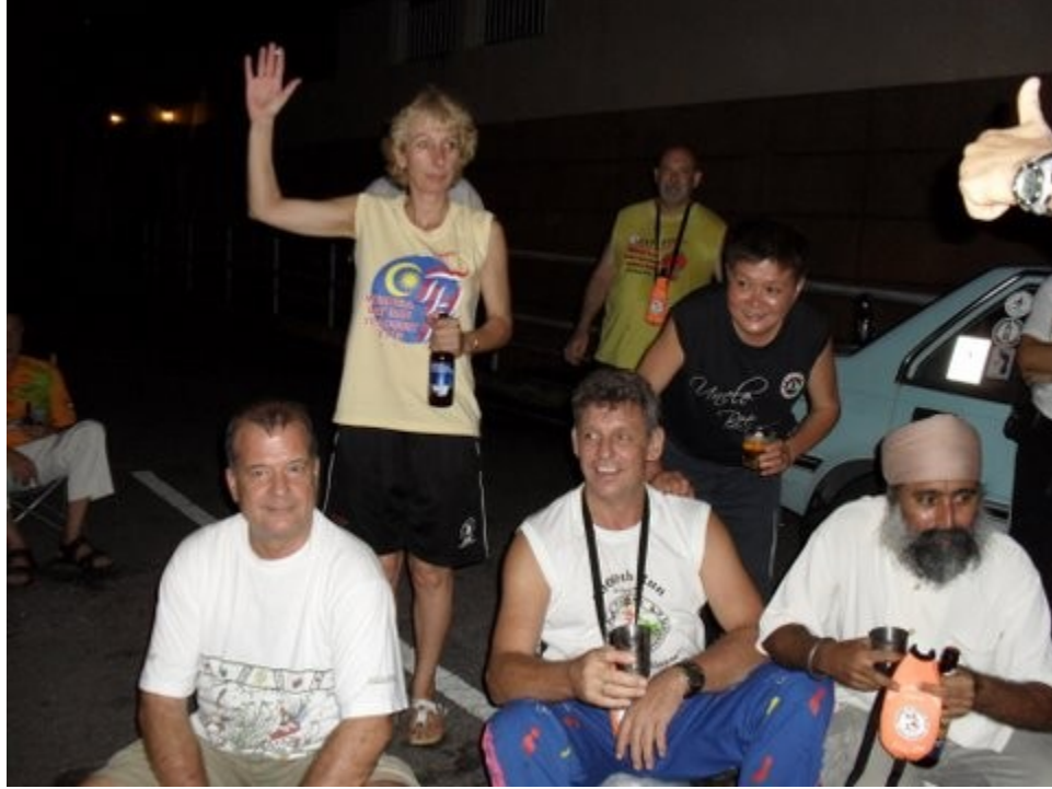
The hare even brought out the cooks to receive their thanks too!