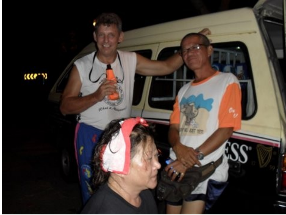
Having a 'cold one'