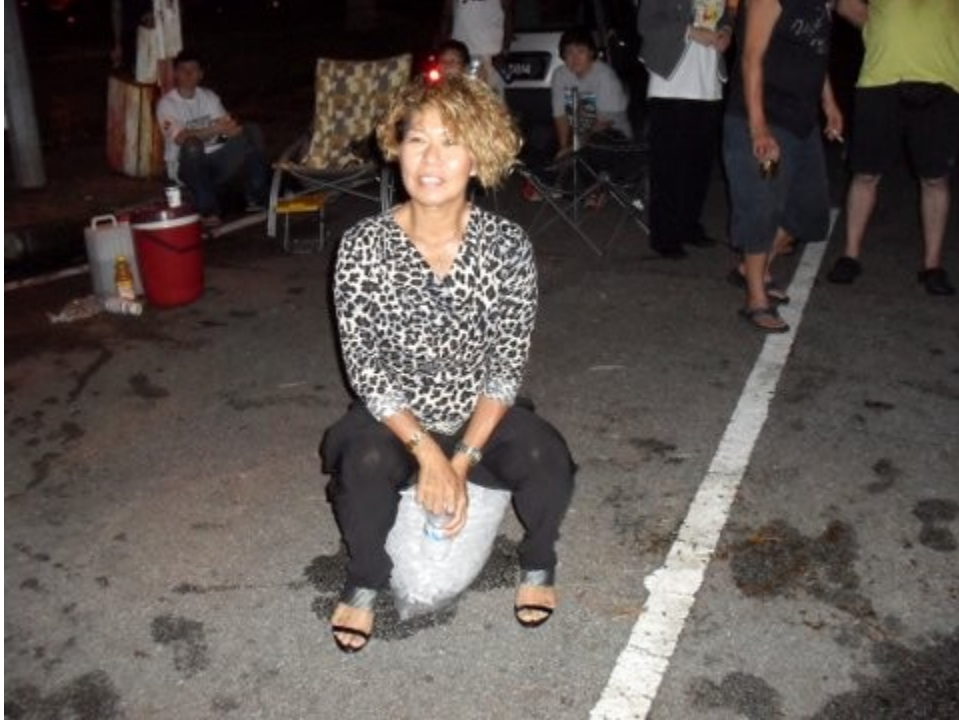
Our ever changing Spiky not properly attired !!