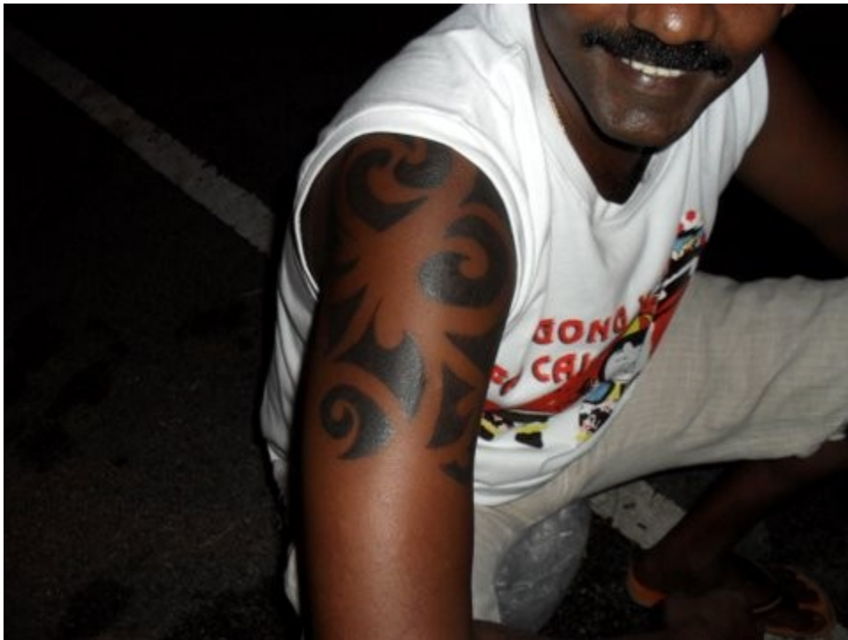
Grasshopper's now infamous tattoo