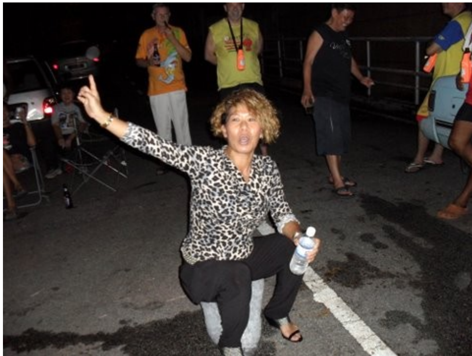
And then there was one!!