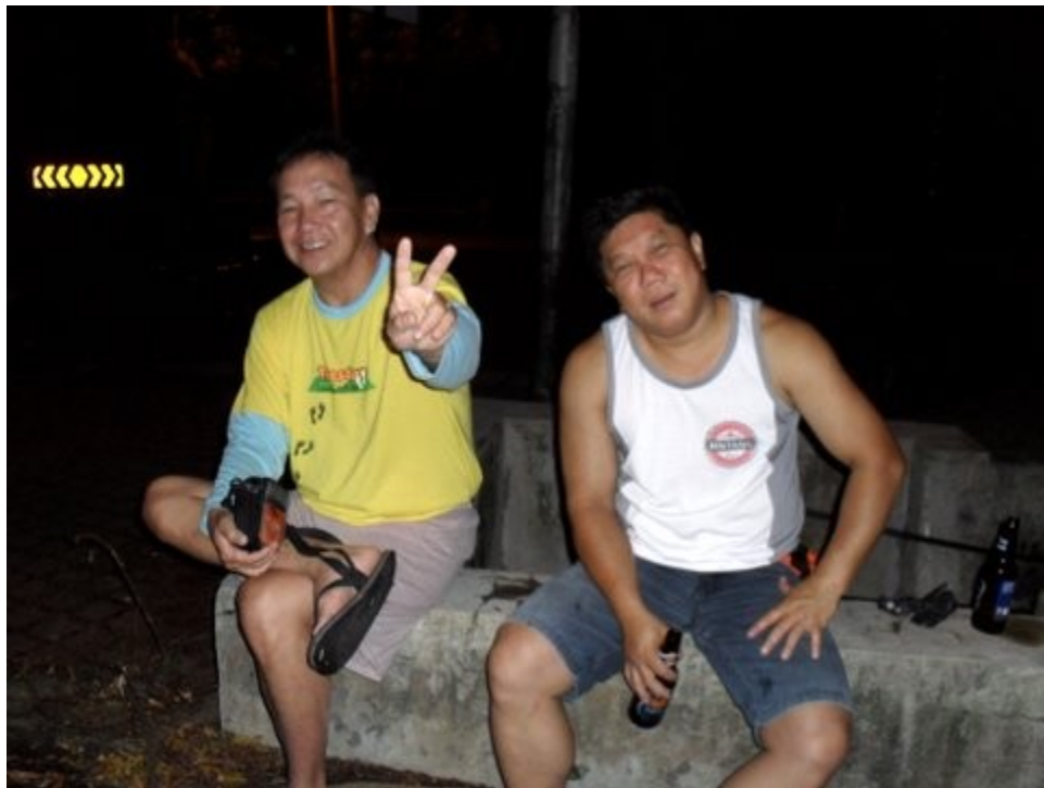
Horse can count. Yes there are two of you!!