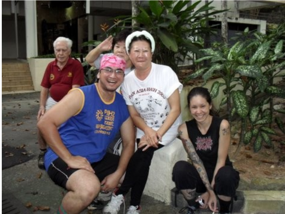
Some of the members with G (on the right)