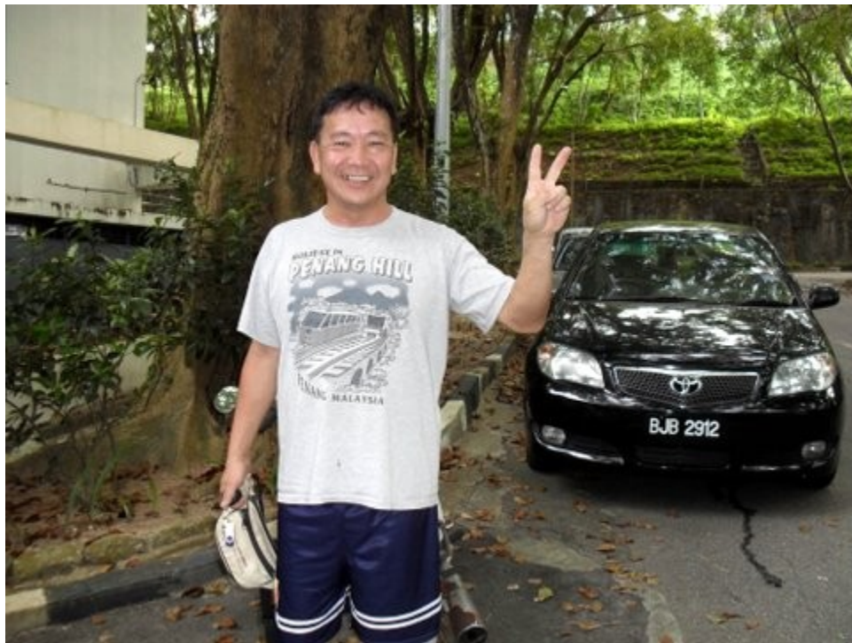
Oh I see, you went round twice!!