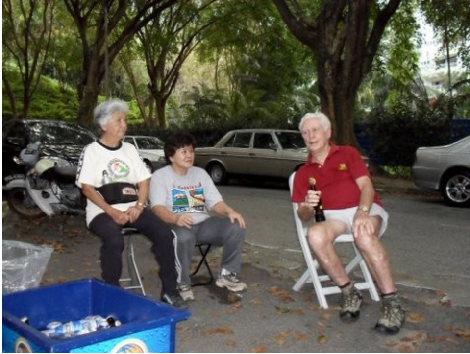
The best place to be!! Next to the beer box!!