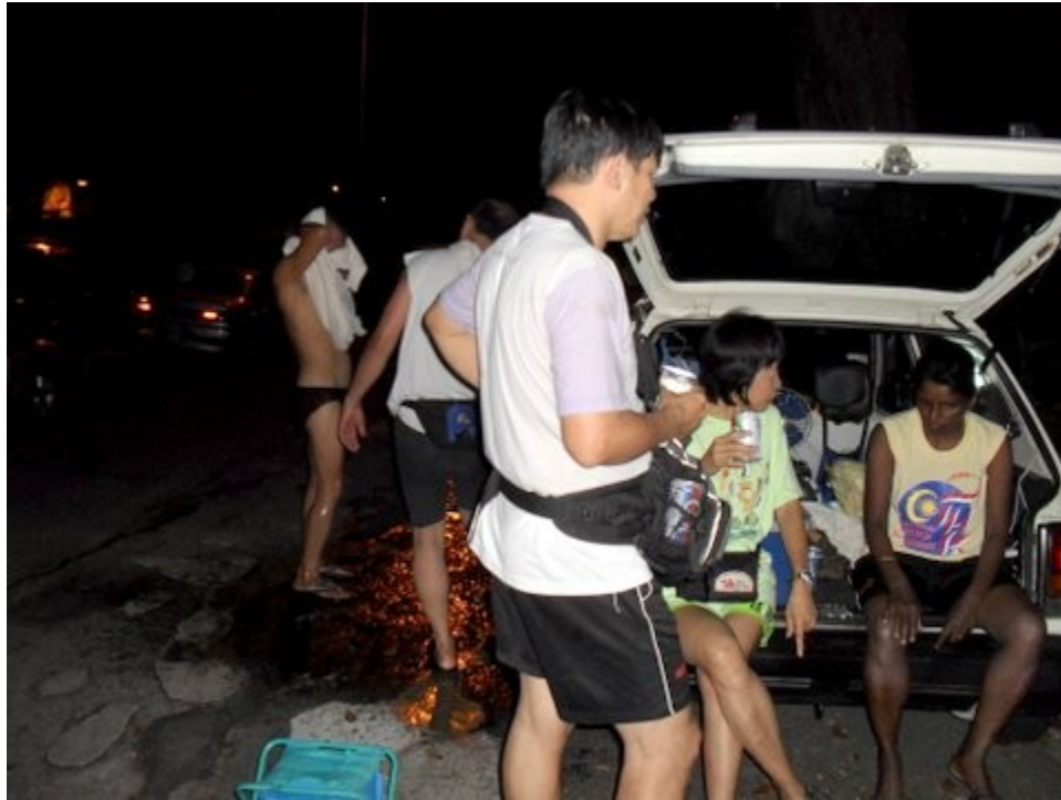
Relaxing, Chatting, semi naked men in the background.... All in a night's hashing at the Harriets!