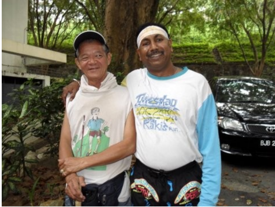
Comrades in arms!!