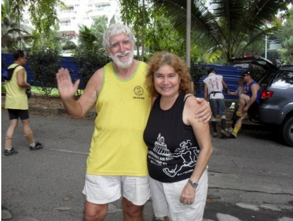
The Bunny and her co-cook. Many thanks for a good night's Hashing!!