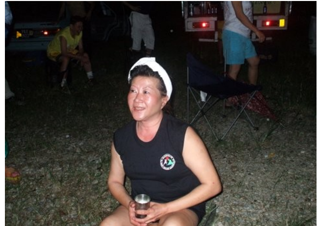
But I was making an appointment!!