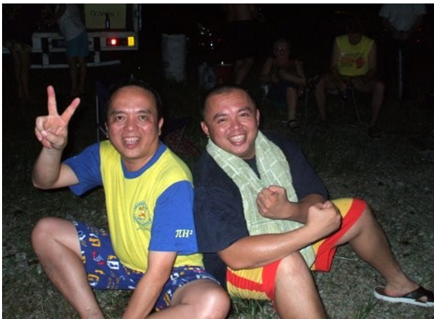
What a brilliant pair of songsters!!!