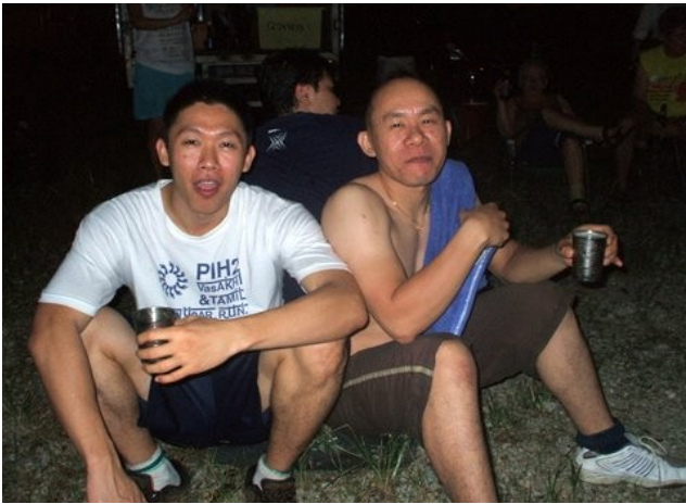
Welcome Welcome Welcome. Please come again.