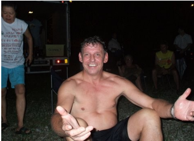
Congratulations on a super feat on your feet!!