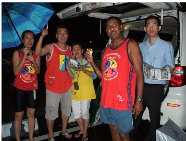
Hair raising hares!!