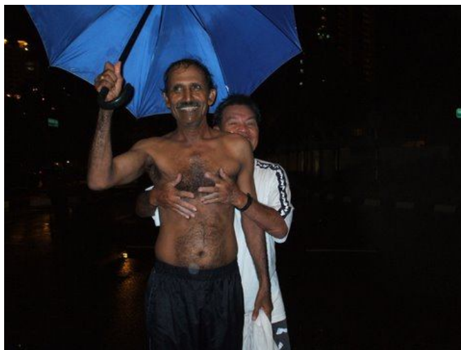
What are friends for if not to hold up your boobs!!