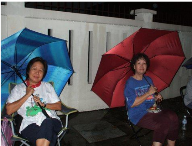
I'm sitting in the rain, just sitting in the rain, what a wonderful feeling....

No circle this week but here are some photos of the evening.