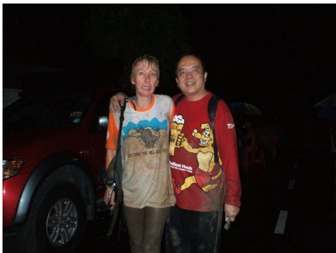
YES!!!!!! We made it!!!!!! Finally!!!!!!!!!!!!!!