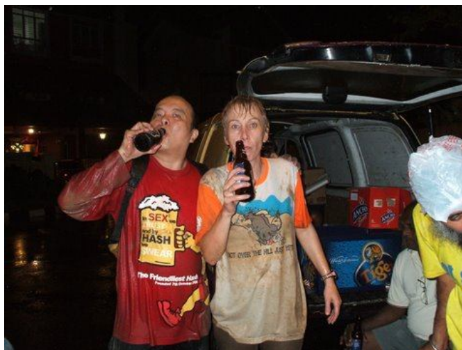
A well earned beer to wash away the mud!!