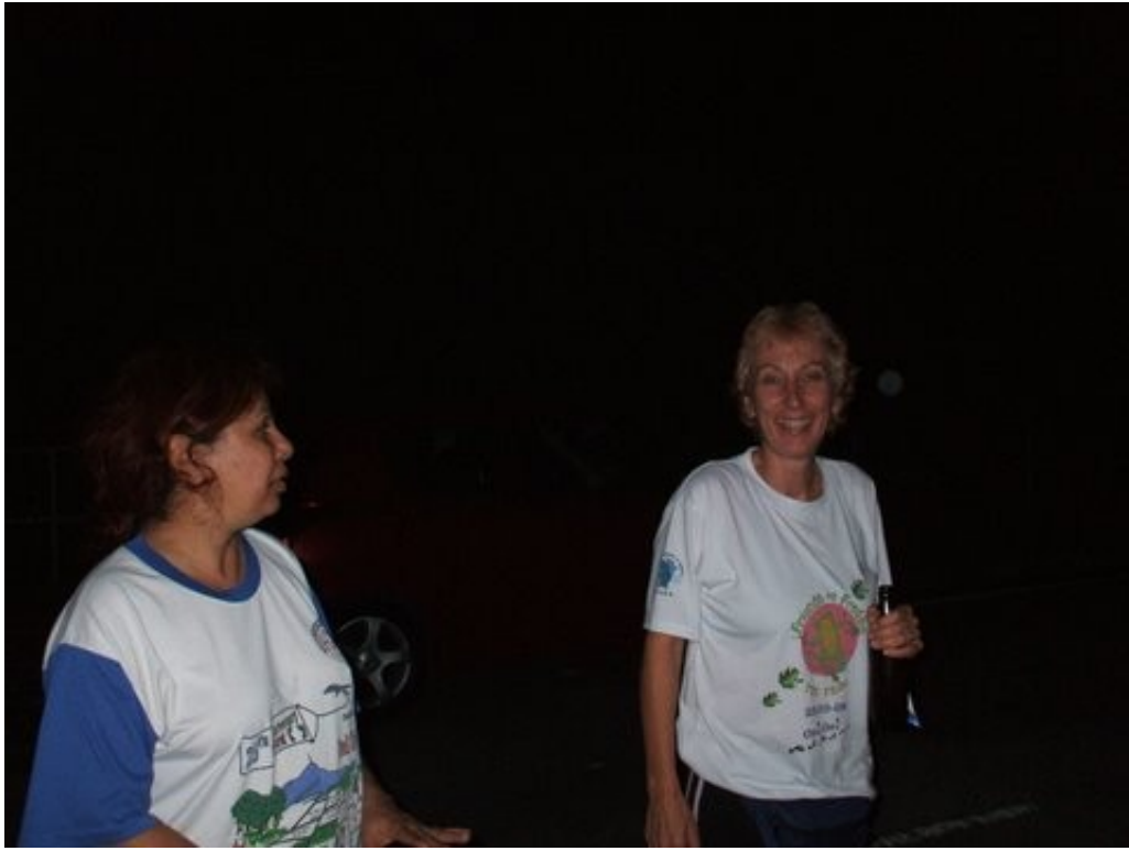
OUR BUNNY OF THE DAY!!! Many Thanks Bibi Tulips!