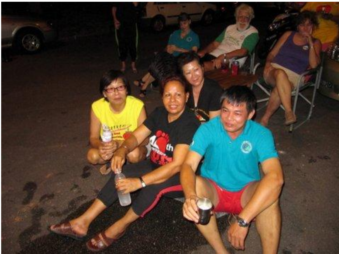
RUN SETTING IS THIRSTY WORK