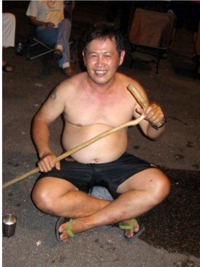
HENEIKAN'T DO THIS WEEK