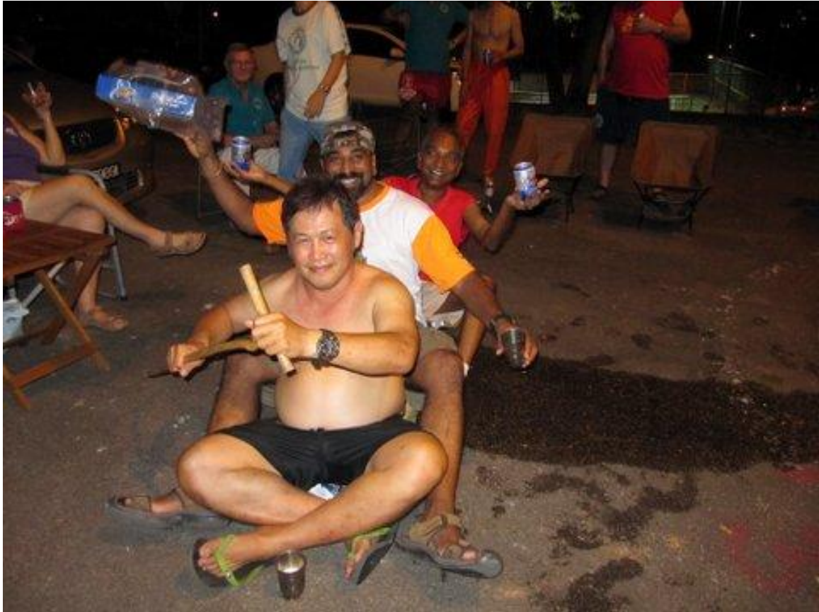
A MAGIC CARPET RIDE