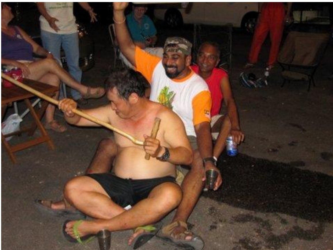
"STEADY AS SHE GOES THERE CAPTAIN"