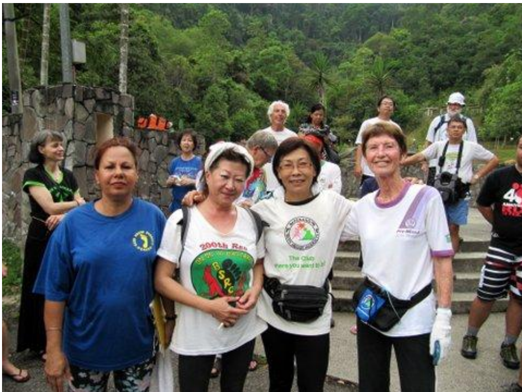
The "NEW" Committee