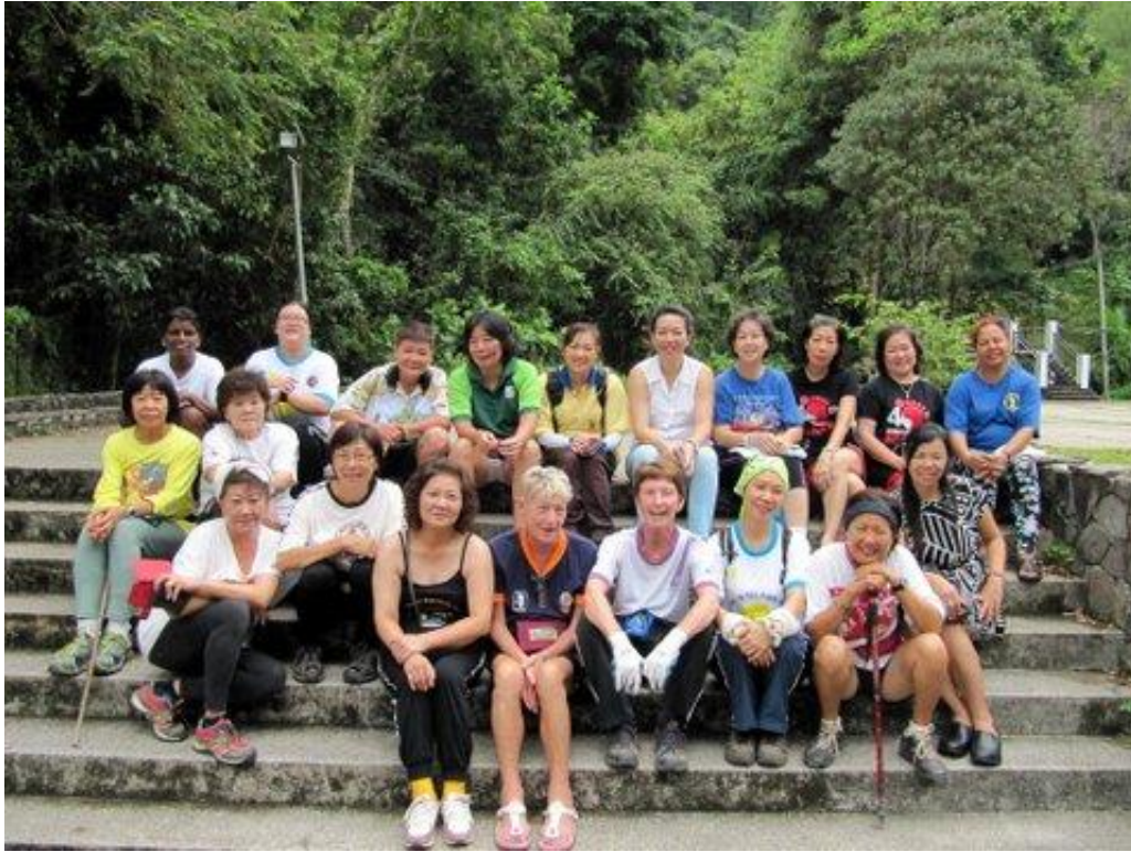
Ladies at the AGM