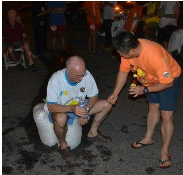
Only to be treated to an “unnecessary” song about his alleged activities last night!