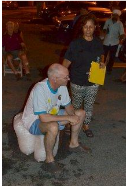
The hare is congratulated