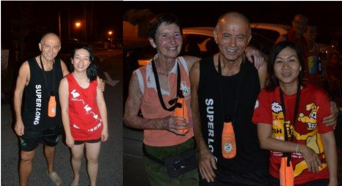
And "Mr Superlong" impressed all the women!