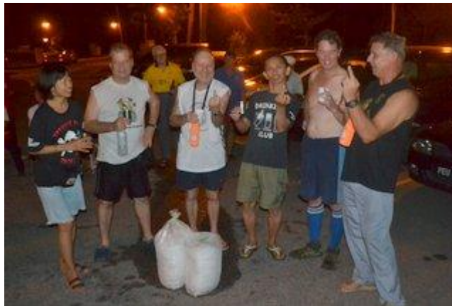
The magnificent 6, the only ones on paper all the way!