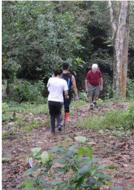
Went in late and got lost