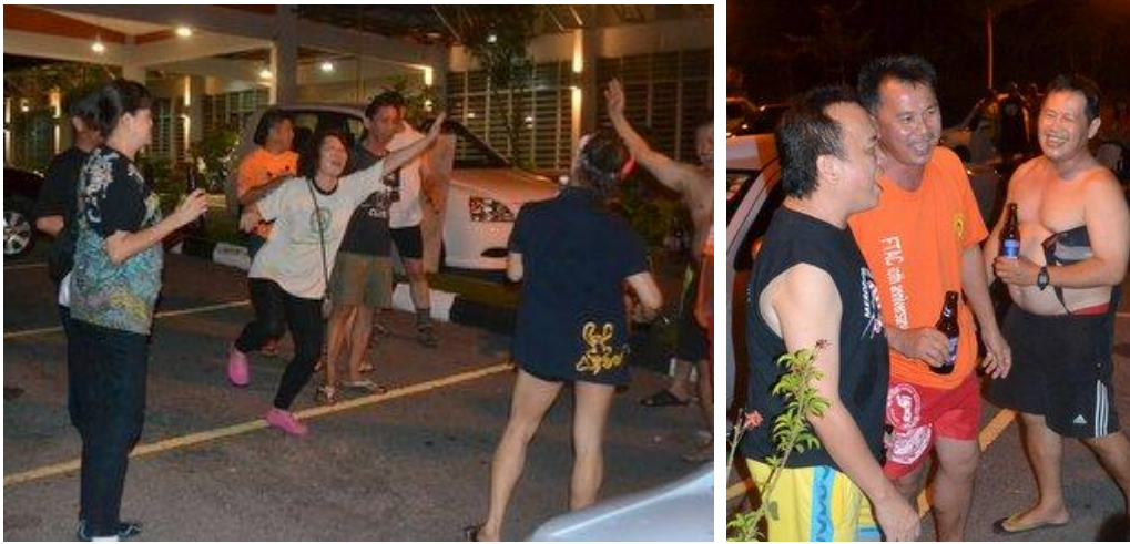
So a good time was had by all.