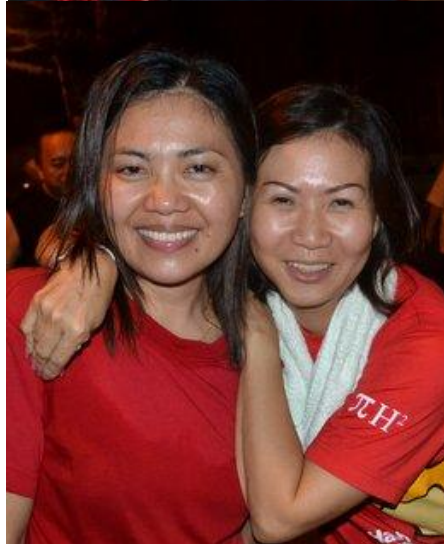
Seems everyone wants to hug them!