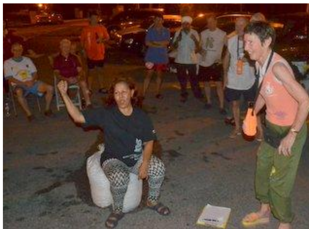
GM on ice... as usual!