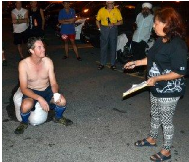
Shit in the Pit, topless on ice!