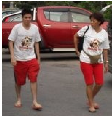
Coincidence? I think Mummy dressed him!