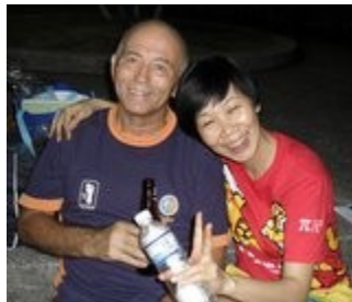
All the usual suspects!