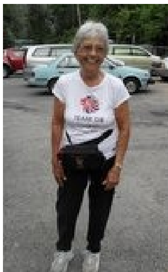
Representing the British Olympians