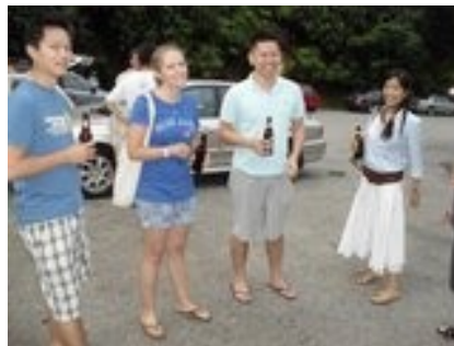
Uncle Bee's guests