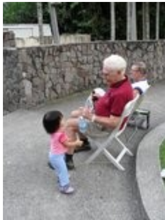
A great place to share a drink or two!