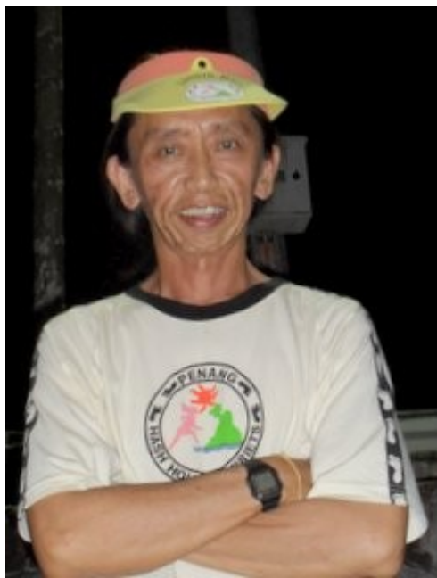
The Hare of the day