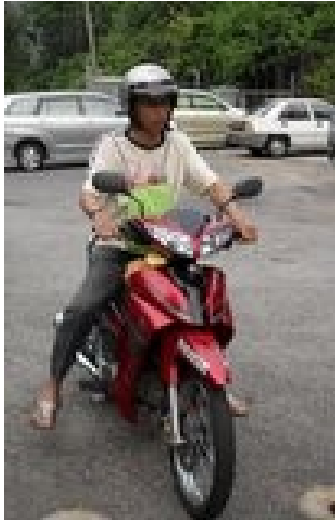
The food's here