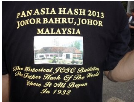
With his contentious shirt!