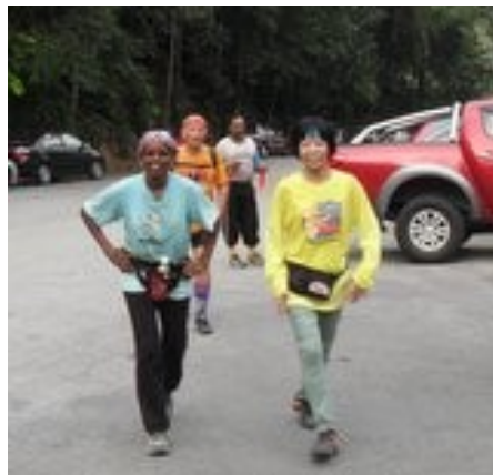
Front runners back