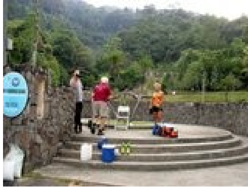
The Quarry Recreational Park