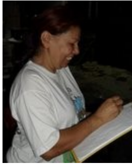
GM thinking up the charges!