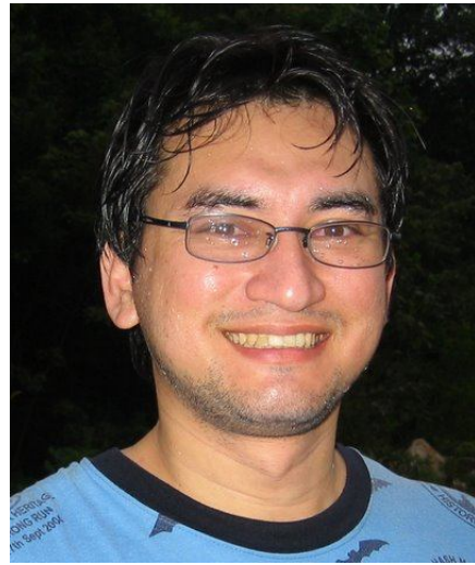
Suaran – aka By Pass