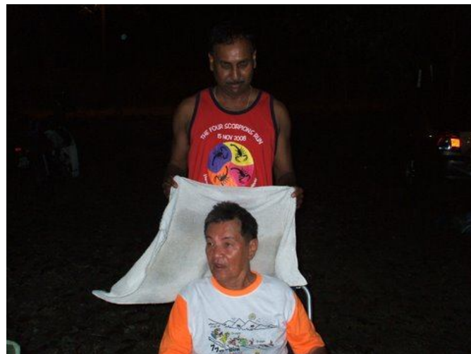
Short back and sides Sir???