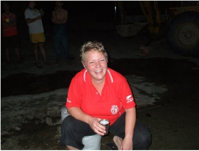
But I was tired!!!!!!!!!!!!!!