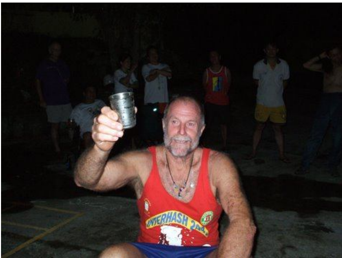
40 Aussi Hashers – A goodly number!!!