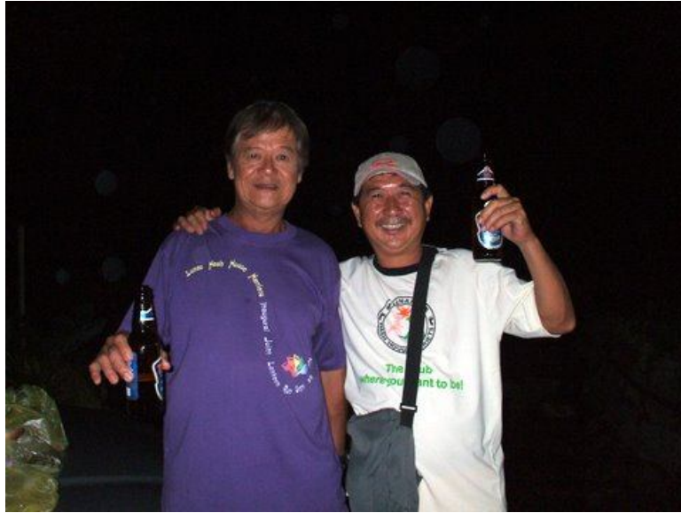
The Hosts for the evening! Many thanks Good Licker and Busy Body