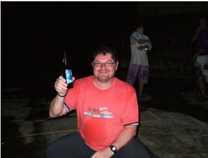
A virgin no longer