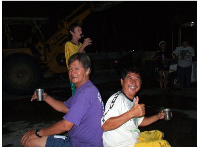
Thanks guys. Good night. Very good!