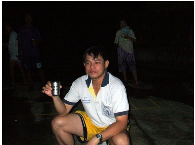
Thanks for last week. Great!