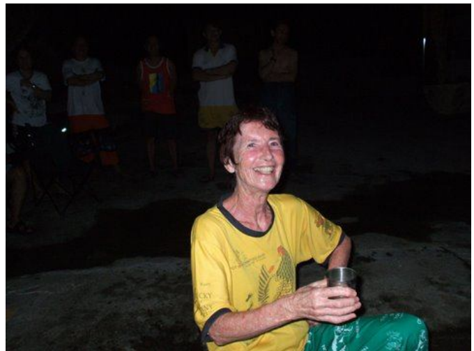
Miss Balls Up