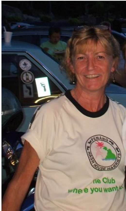
The BUNNY Many Thanks.